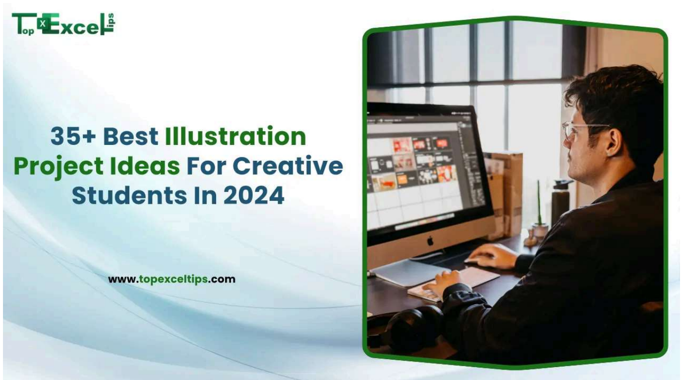
Illustration is all about telling stories through drawings and images. It lets artists turn their ideas into something visual and creative. As we move into 2024, learning